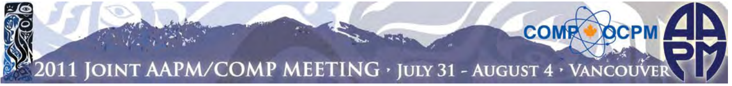
EXHIBIT SPACE APPLICATION AND CONTRACT

Return by February 24th for first consideration in space assignments.