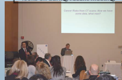
Cancer Risks from CT scans. How we have some data, what next?