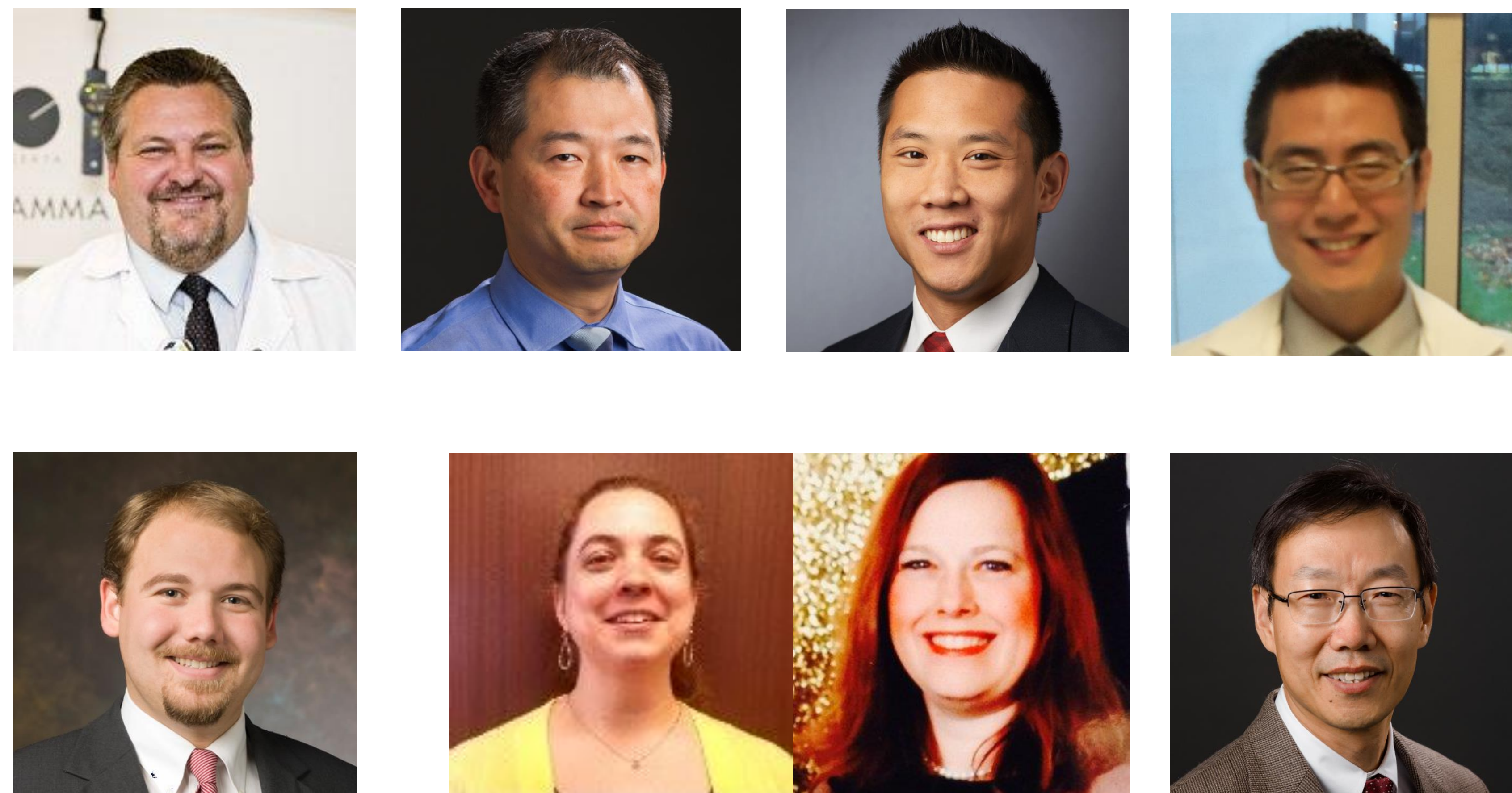
From Left to Right: