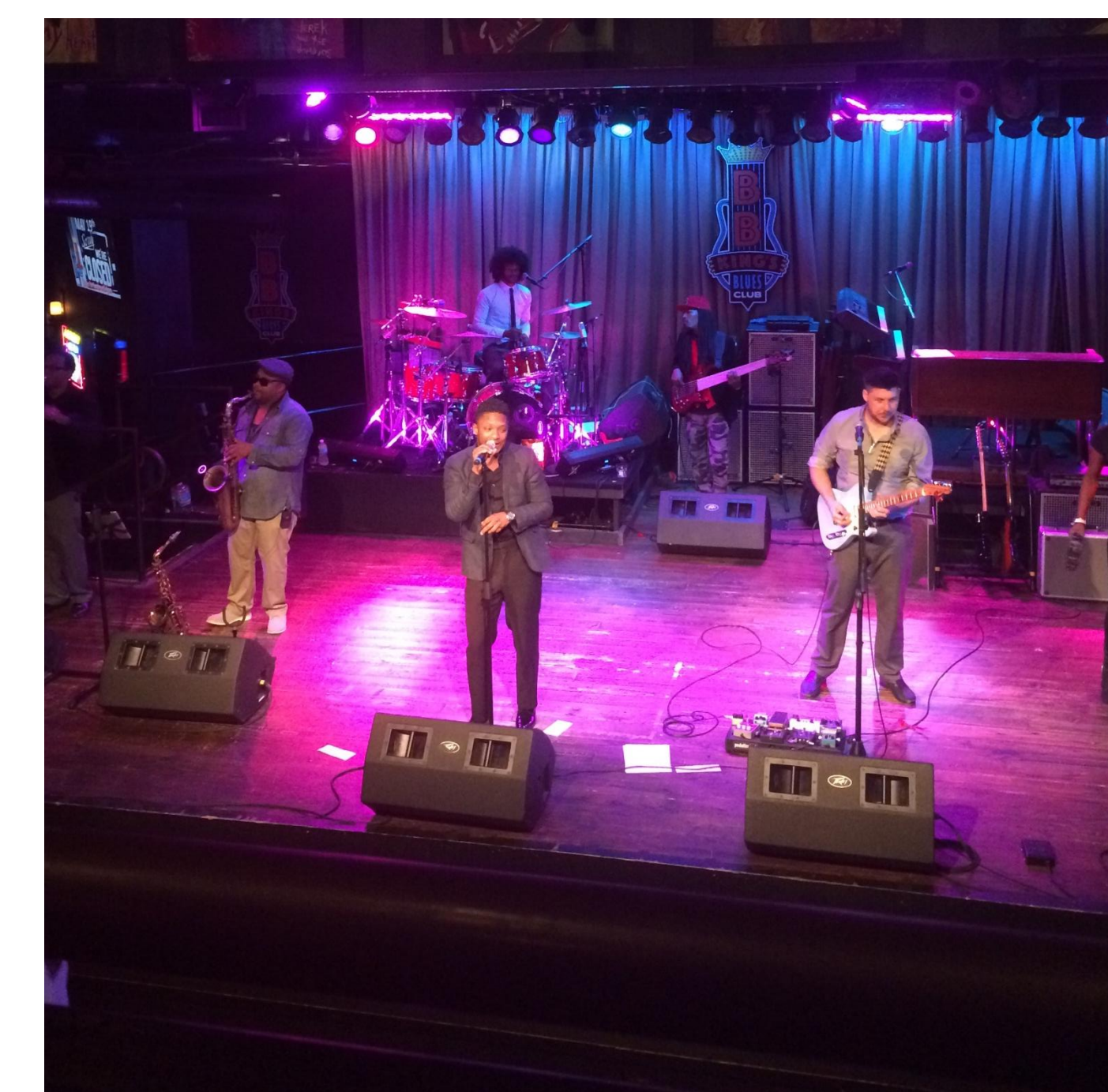
The night outs during the chapter meeting were the highlight of the social event, where members often connected professionally,