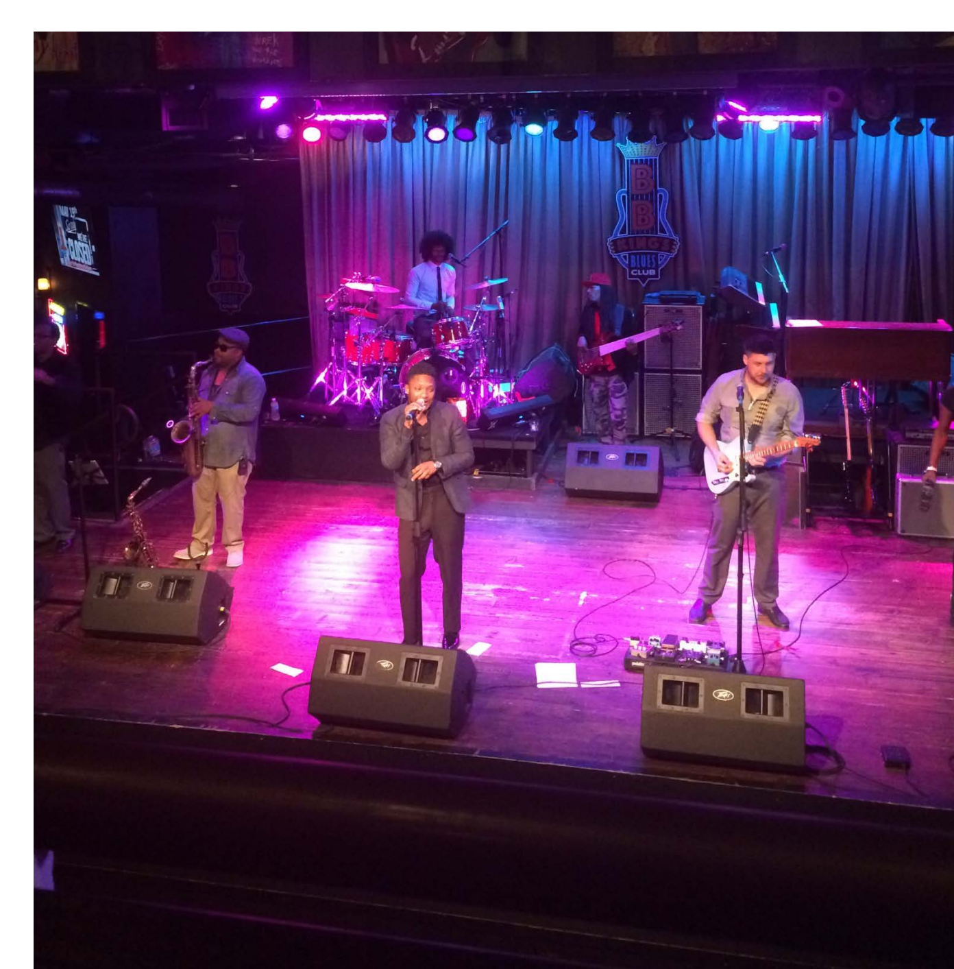
The night outs during the chapter meeting are the highlight of the social event, where members often connect professionally,