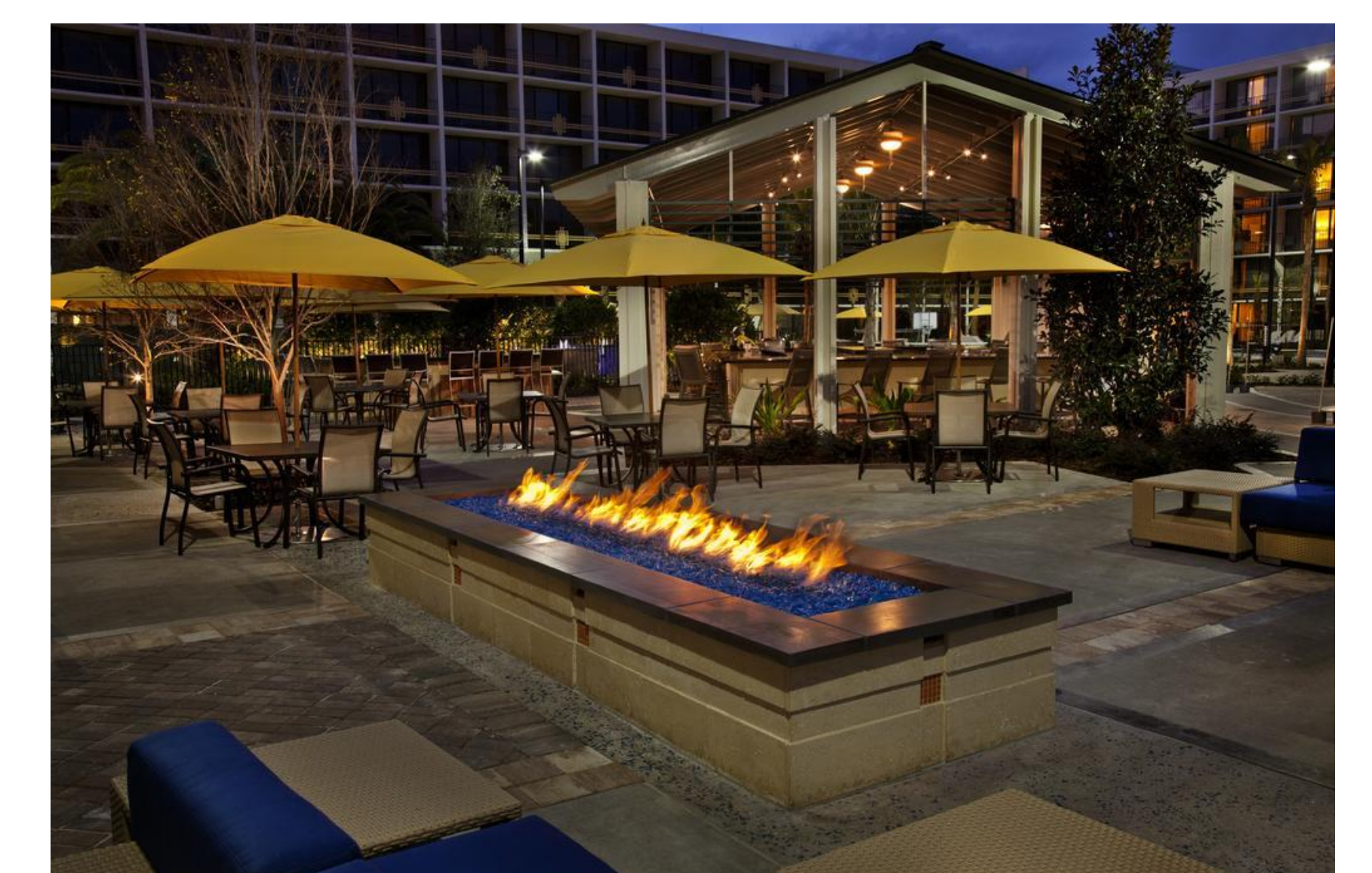
Spring 2018 Night In at the Sheraton Lake Buena Vista Resort in Orlando, FL.