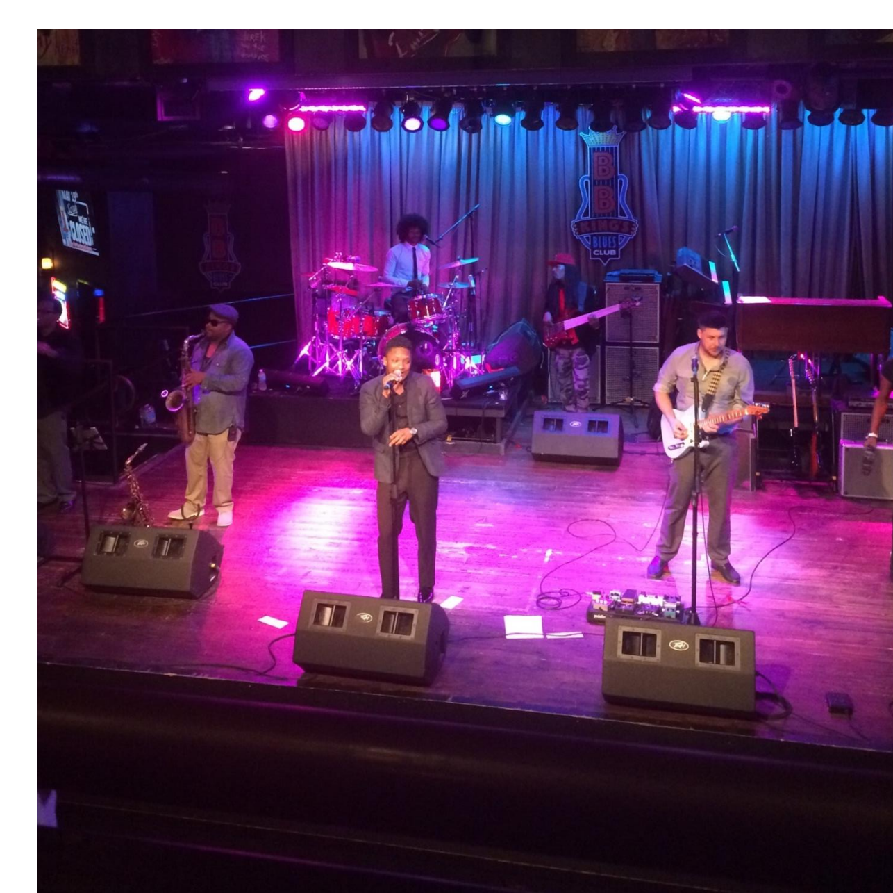
The nights out or in during the chapter meeting are the highlight of the social event, where members often connect professionally,