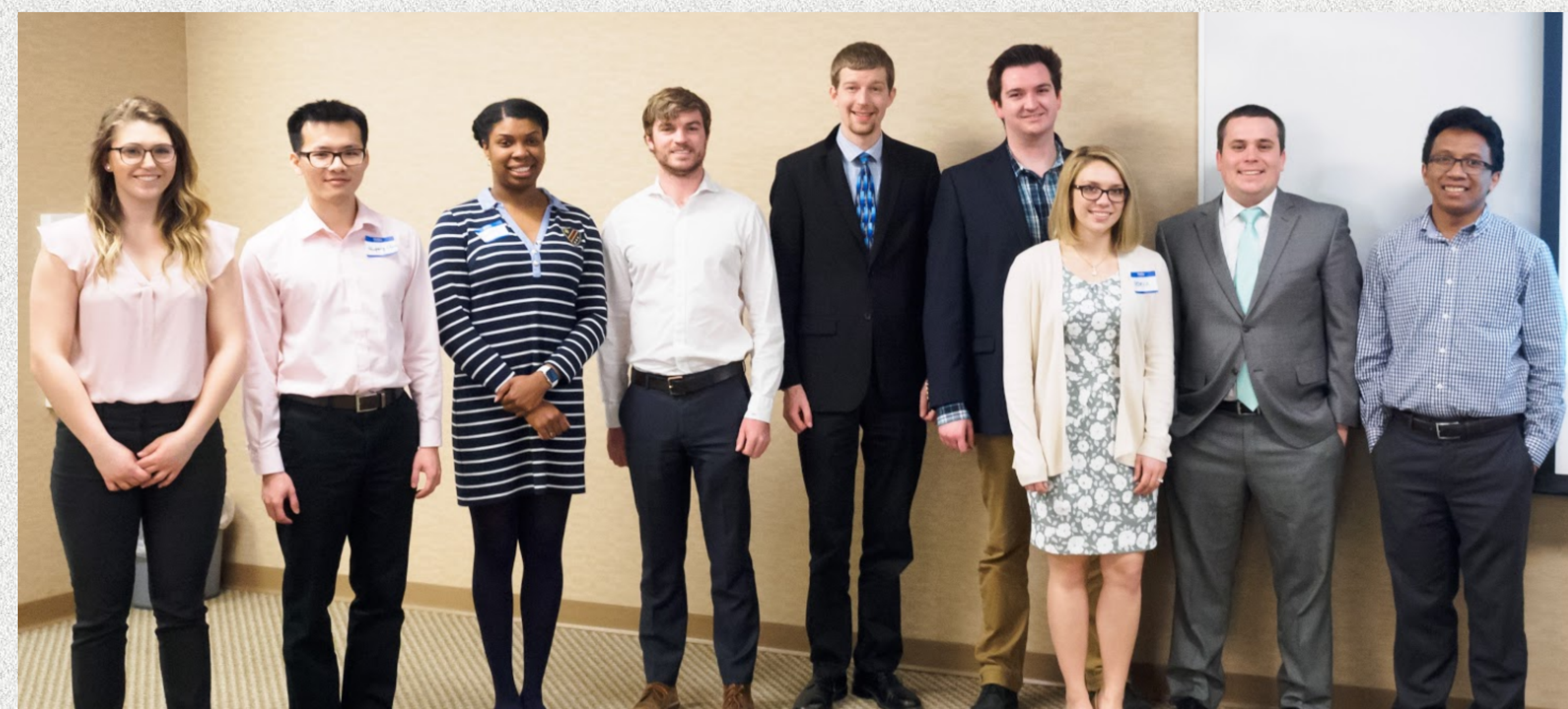
(Above) 2018 GLC YIS participants