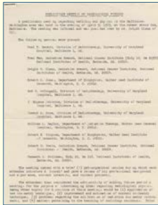
MAC Charter Meeting Notes from 1965

1 st known gathering of Physicists on April 9, 1965 at Mohawk Motor Inn. This group would later go on to Charter as "The Baltimore-Washington D.C. Regional Chapter of Radiological Physics"