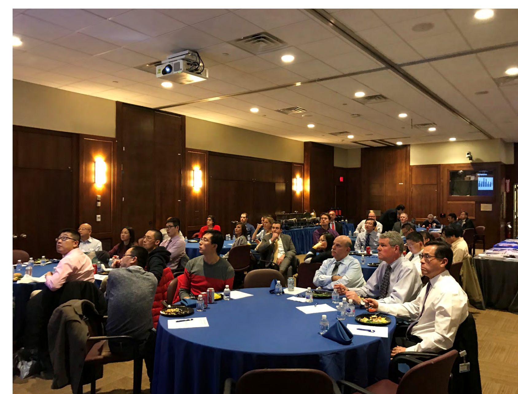
Attendees of Spring 2019 chapter meeting