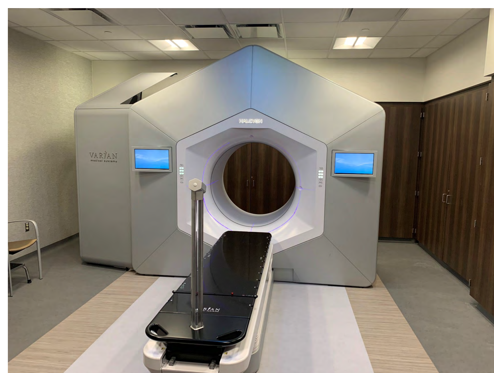
Halcyon machine of Saint Barnabas Medical Center