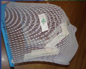
Frameless Stereotactic Localization