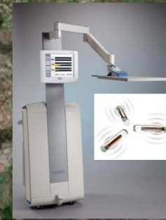
Calypso ® System, for real-time tumor motion tracking, developed in Seattle and acquired by Varian in 2011