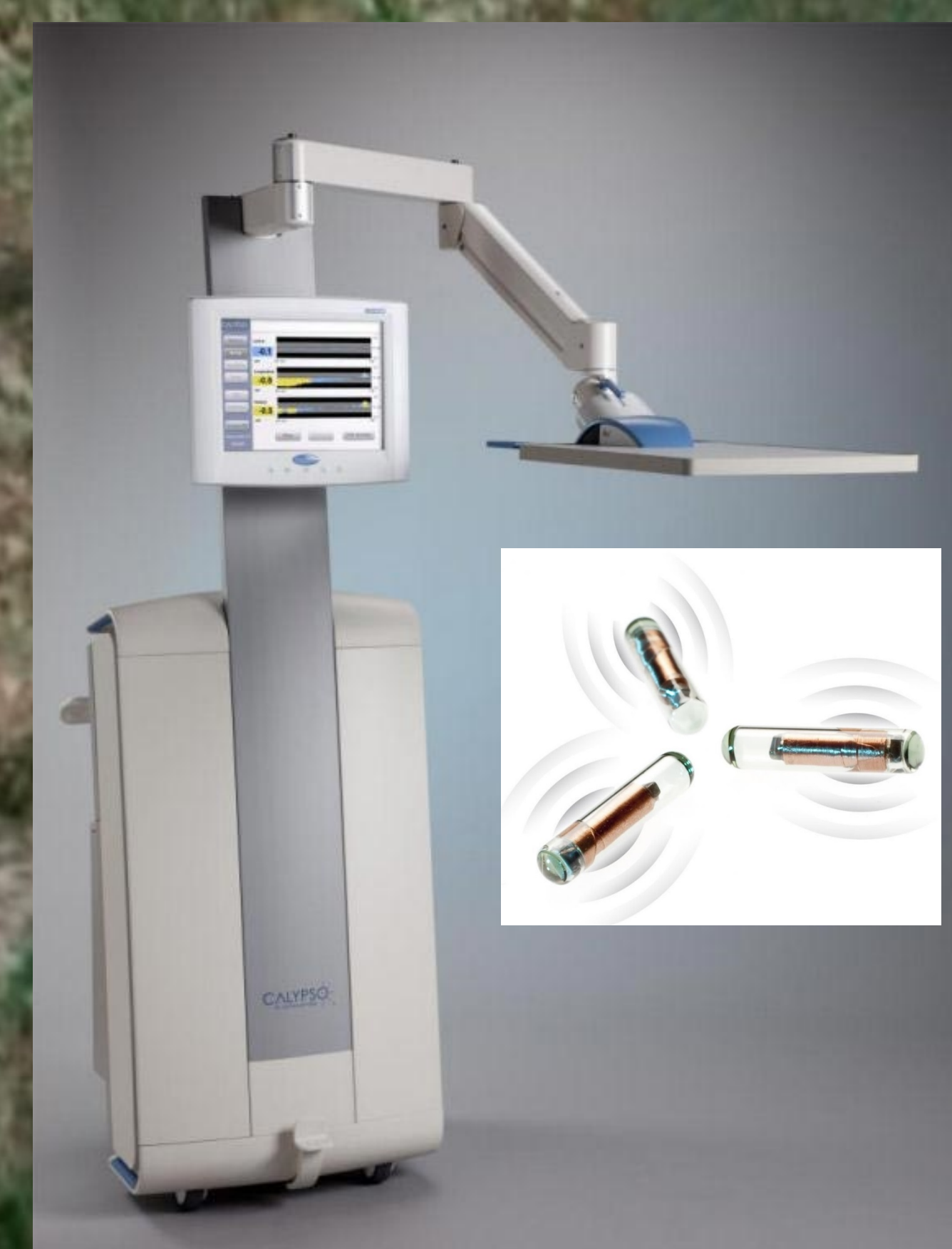
Calypso® System, for real-time tumor motion tracking, developed in Seattle and acquired by Varian in 2011