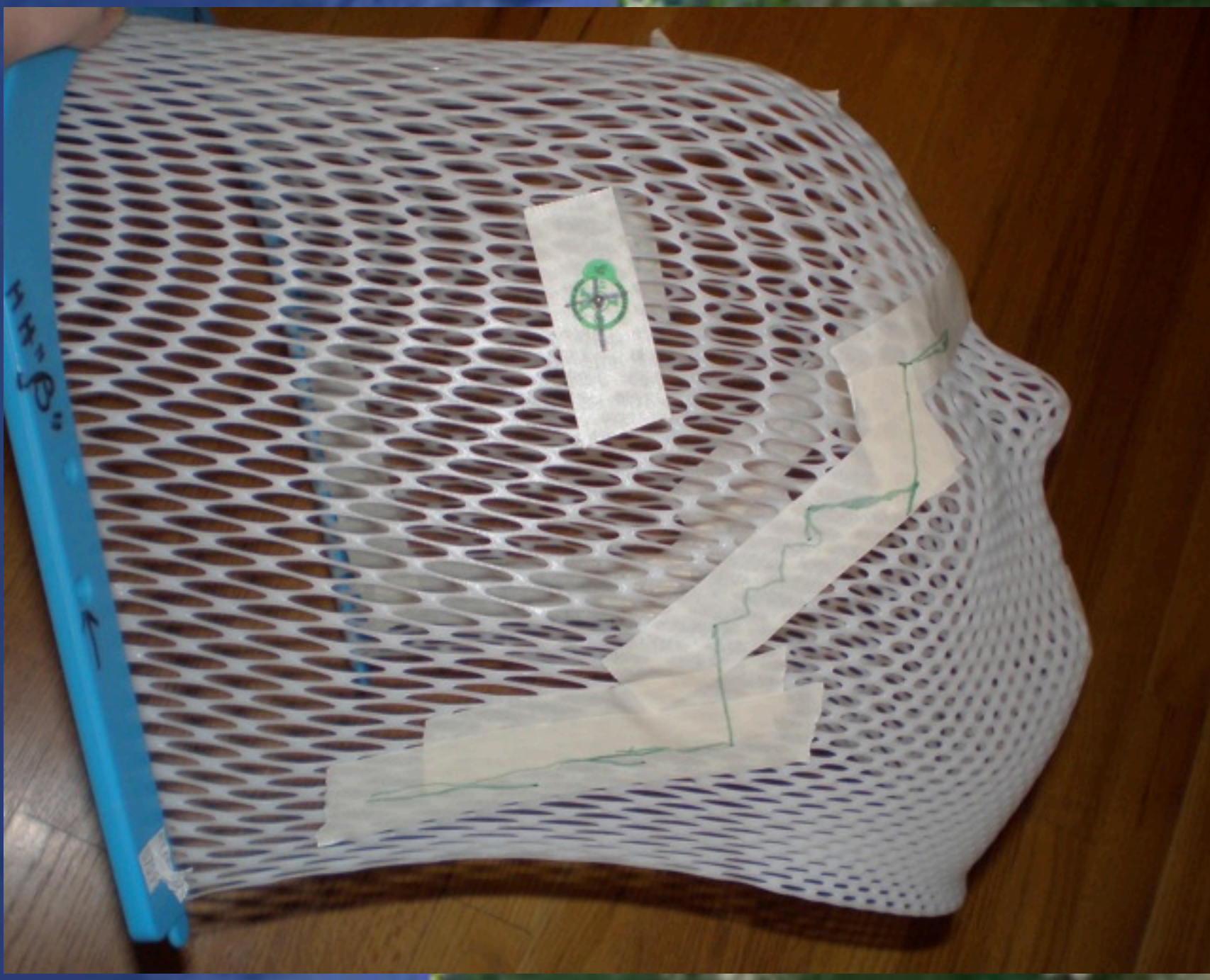
Frameless Stereotactic Localization