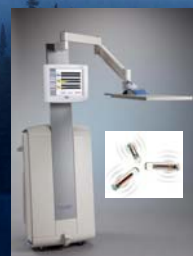
Calypso® System , for real-time tumor motion tracking, developed in Seattle and acquired by Varian in 2011