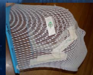
Frameless Stereotactic Localization