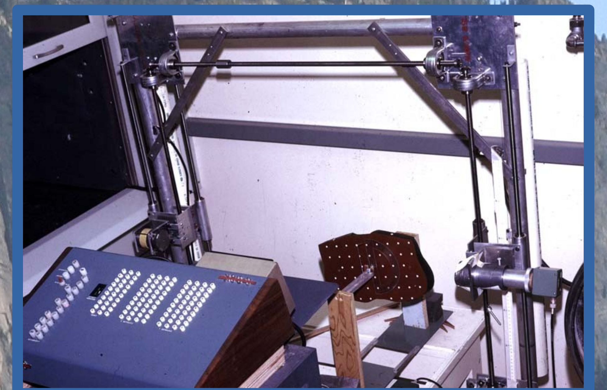
First MeV CT-simulator