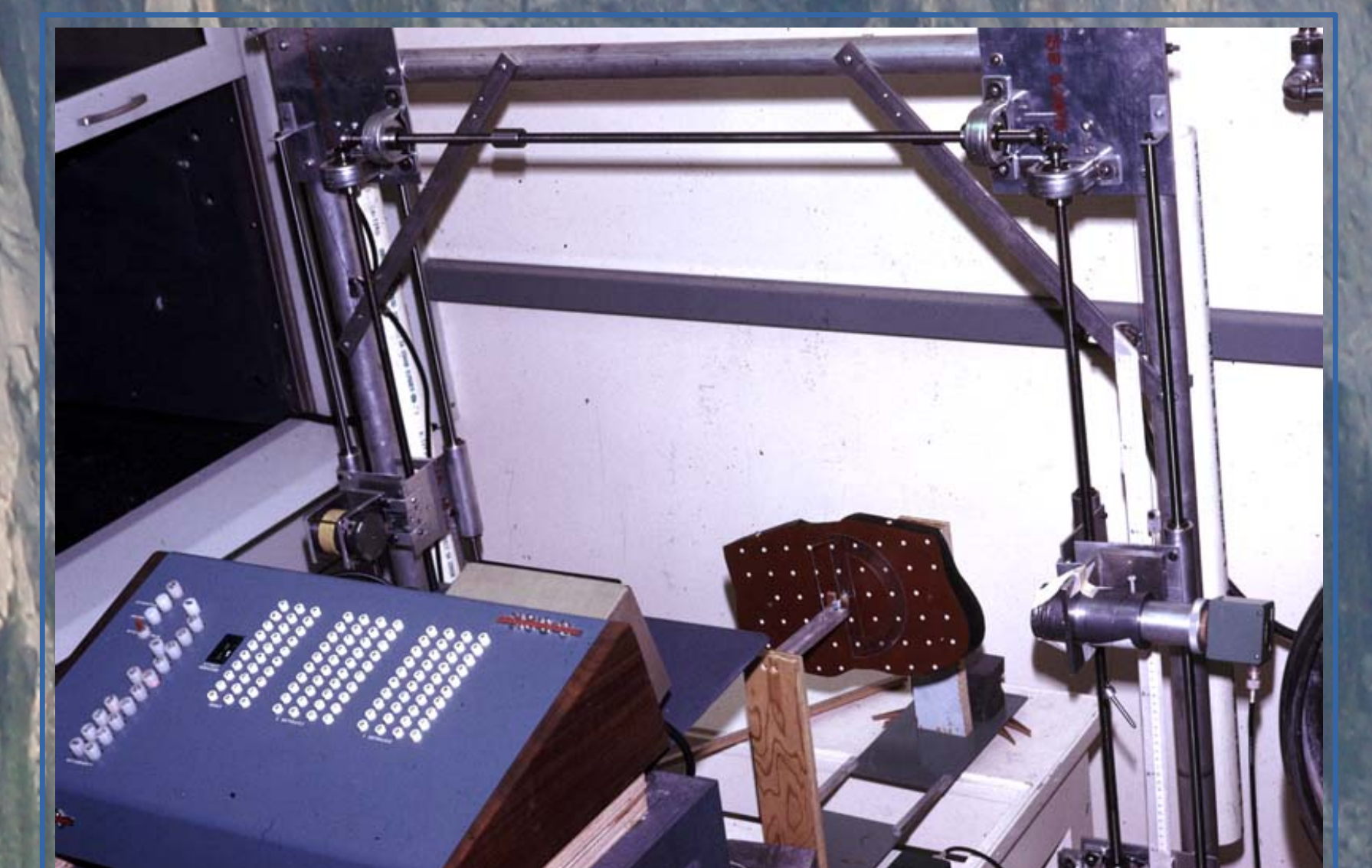
First MeV CT-simulator