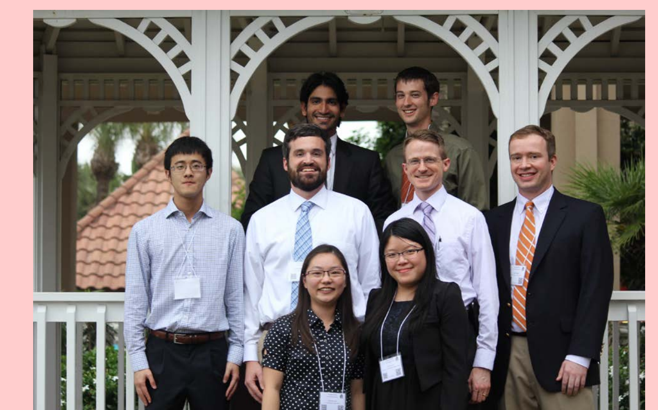
2015 SWAAPM Young Investigators winners